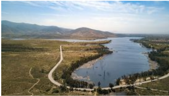
Lower Otay Lake