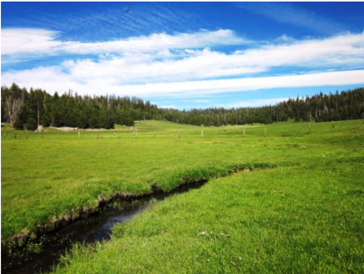
Nine Mile Creek at Casa Vieja meadow. Golden Trout restoration project area.