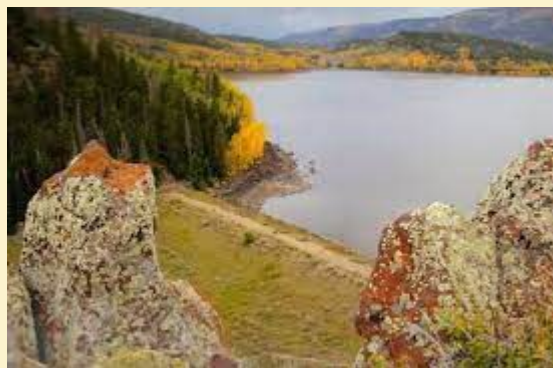
Fish Lake, Utah