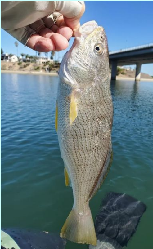
Mel shares a rare photo that shows more fish than fly!