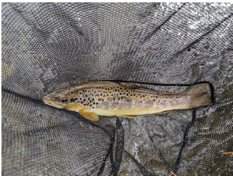
Pennsylvania Wild Brown

I decided to make a downstream drift, as the narrow channel would force me to keep part of my leader on the bank and reduce the distance I could drift a fly drag free. The water was crystal clear and I knew the fish were spooky, so I stayed well up stream and limbered up a cast. I laid it out, pulling up short to cause the line to puddle and give me the drift I wanted. It worked, but the fish missed the fly. I presented the same cast and this time the hook found purchase. It was a wild brown trout of maybe 5 inches. Not a trophy in size for some, but certainly in all respects a prize for me. I'd been looking at this creek for months and fished it without success a dozen times. Now, on a dreary winter afternoon, I held my quarry. The barbless hook slipped out with ease and the fish darted off for cover. I no longer felt the chill in the air; that first little fish warmed me right up.