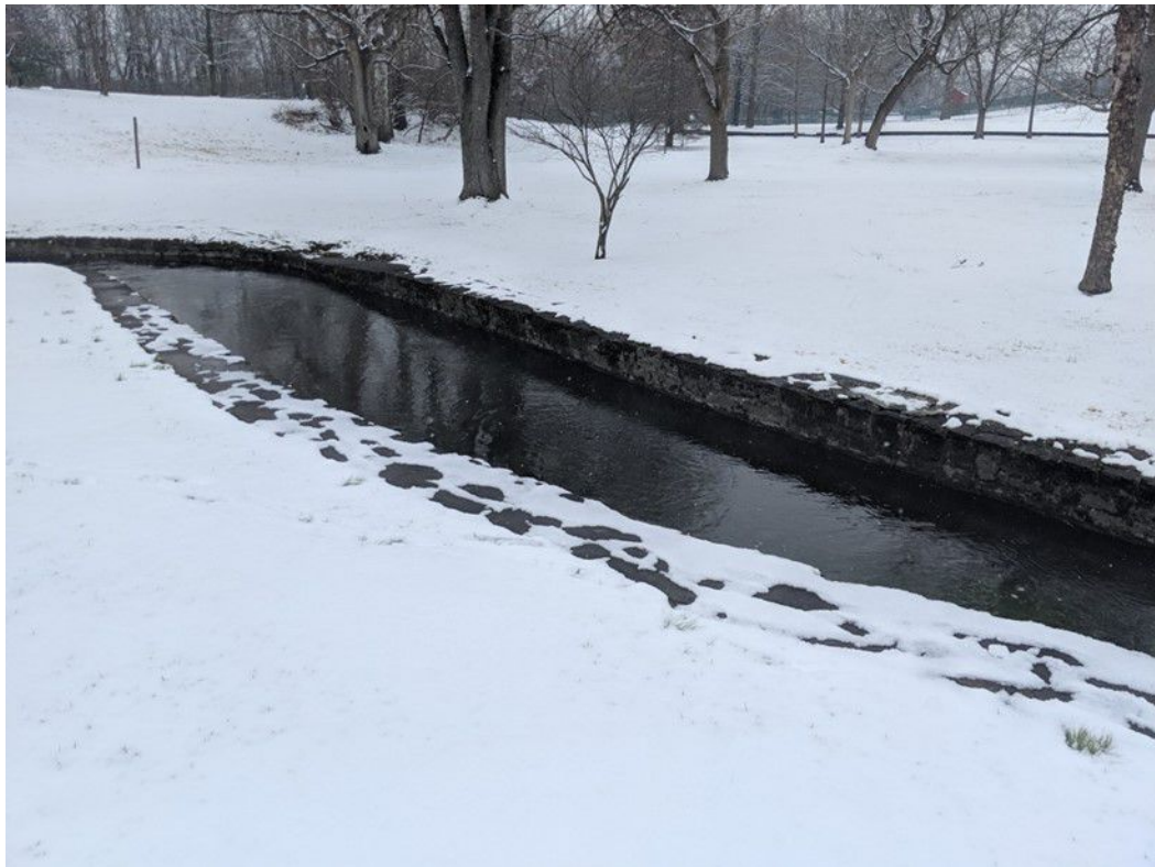
Figure 1 Letort Spring Run

I was very fortunate to have ended up in an assignment that had a trout stream right outside of my quarters. My back porch over looked Letort Spring Run as it cuts through Carlisle Barracks. It is not the marshy spring creek that flows on either side of the base. Here, it is a disciplined and regimented waterway, hemmed into a man-made channel of stone and mortar. No undercut banks, no tree roots, nor any other structure to provide fish with security. It runs for about a half mile further beyond my quarters before it exits the base and joins the other branch after flowing under Post Road. In the stretch below my home there was a bit of cover, in the form of some deeper pools formed at bends in the flume. These were the places I have seen a few small trout, though one source assures me that in the fall there are bigger fish in there. Personally, I'd not seen a fish over six inches long in this stretch. I'd seen big fish above and below the base but not here. Still it is lovely water and nice to know that I could look out my window at a famous trout stream.