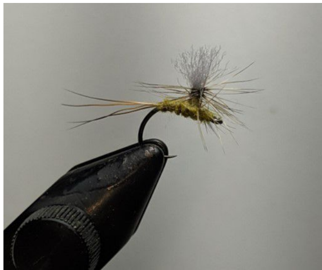
Figure 2 Basic BWO Parachute

I went home and into my basement lair. My bench was neither organized nor prepared for tying, but I found some hair, dubbing, yarn, and hackle. I have been using Firehole Sticks for my trout flies and I really like them. I also like that they are from a Montana company that is family owned. I used a Firehole 413 competition hook in size 18 to tie on a tail of 4 white moose hairs, a body of fine synthetic olive dubbing, counter wrapped with a loop of thread, a wing of grey poly yarn, and a Whiting dun neck hackle. I prefer a parachute style fly most of the time and that is what I turned out. I also tied a soft-hackle, spinner, and cripple with that same materials while I had them out. Six flies in 30 minutes, I could still fish a bit before I wrapped up my paper. I can type when its dark out and these fish would not be rising all day.