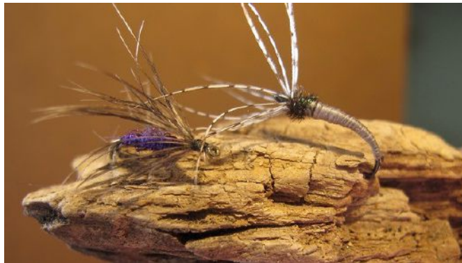
The lowly Soft Hackle

The soft hackle fly has stood the test of time.