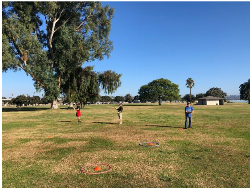
Intermediate Casting Class

Follow all the action on the Clubs Facebook page!